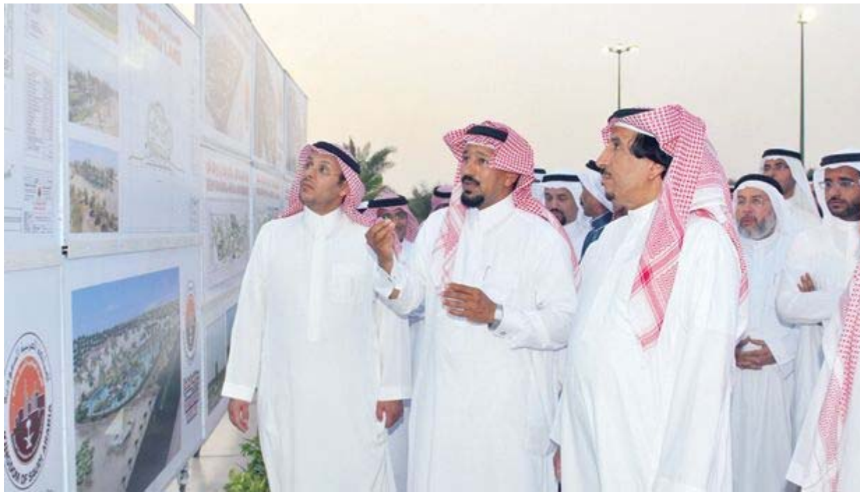
Prince Saud bin Abdullah bin Thunayan, chairman of the Royal Commission, is briefed Tuesday on new projects being implemented in Yanbu.